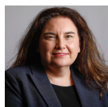
Katy Clark Scottish Labour