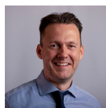
Deputy Convener Russell Findlay Scottish Conservative and Unionist Party