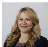
Pauline McNeill Scottish Labour