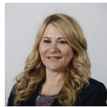
Pauline McNeill Scottish Labour