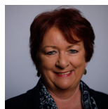
Rona Mackay Scottish National Party