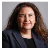
Katy Clark Scottish Labour