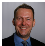
Deputy Convener Russell Findlay Scottish Conservative and Unionist Party