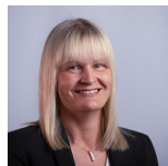
Sharon Dowey Scottish Conservative and Unionist Party