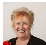
Christine Grahame Scottish National Party