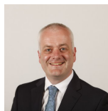
Mark Ruskell Scottish Green Party