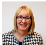
Beatrice Wishart Scottish Liberal Democrats