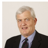
Maurice Corry Scottish Conservative and Unionist Party