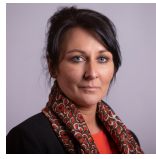
Convener Siobhian Brown Scottish National Party