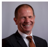
Jim Fairlie Scottish National Party