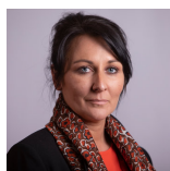
Convener Siobhian Brown Scottish National Party