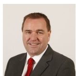
Neil Findlay Scottish Labour