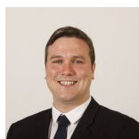
Tom Arthur Scottish National Party