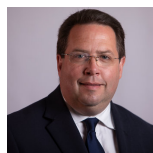
Craig Hoy Scottish Conservative and Unionist Party