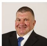
Jeremy Balfour Scottish Conservative and Unionist Party