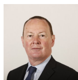
Bill Kidd Scottish National Party