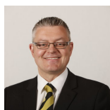
Stuart McMillan Scottish National Party