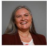
Roz McCall Scottish Conservative and Unionist Party