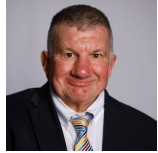
Jeremy Balfour Scottish Conservative and Unionist Party