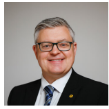
Stuart McMillan Scottish National Party