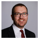
Oliver Mundell Scottish Conservative and Unionist Party