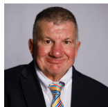
Jeremy Balfour Scottish Conservative and Unionist Party