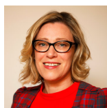
Convener Gillian Martin Scottish National Party