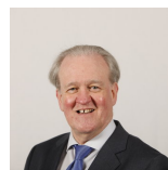
Stewart Stevenson Scottish National Party