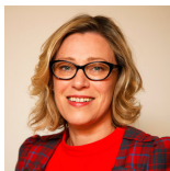
Convener Gillian Martin Scottish National Party