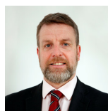
Finlay Carson Scottish Conservative and Unionist Party