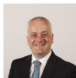
Mark Ruskell Scottish Green Party