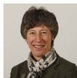
Liz Smith Scottish Conservative and Unionist Party