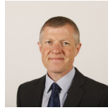
Willie Rennie Scottish Liberal Democrats