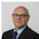
James Dornan Scottish National Party