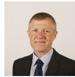
Willie Rennie Scottish Liberal Democrats