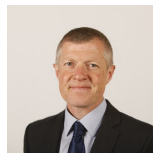
Willie Rennie Scottish Liberal Democrats