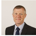
Willie Rennie Scottish Liberal Democrats