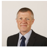
Willie Rennie Scottish Liberal Democrats