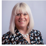
Convener Sue Webber Scottish Conservative and Unionist Party