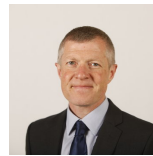
Willie Rennie Scottish Liberal Democrats