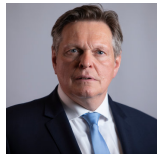
Convener Stephen Kerr Scottish Conservative and Unionist Party