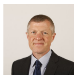
Willie Rennie Scottish Liberal Democrats