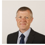
Willie Rennie Scottish Liberal Democrats