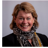
Michelle Thomson Scottish National Party