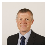
Willie Rennie Scottish Liberal Democrats