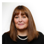
Ruth Maguire Scottish National Party