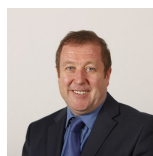
Graeme Dey Scottish National Party