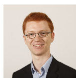
Ross Greer Scottish Green Party