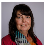
Stephanie Callaghan Scottish National Party