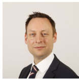
Liam Kerr Scottish Conservative and Unionist Party