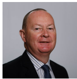
Bill Kidd Scottish National Party