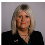
Convener Sue Webber Scottish Conservative and Unionist Party