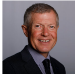
Willie Rennie Scottish Liberal Democrats