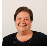
Jackie Baillie Scottish Labour