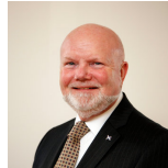
Colin Beattie Scottish National Party