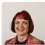
Angela Constance Scottish National Party