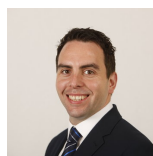
Maurice Golden Scottish Conservative and Unionist Party