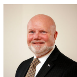
Colin Beattie Scottish National Party