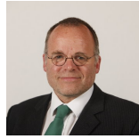
Andy Wightman Independent