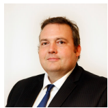
Jamie Halcro Johnston Scottish Conservative and Unionist Party