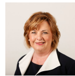
Fiona Hyslop Scottish National Party