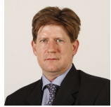
Alexander Burnett Scottish Conservative and Unionist Party