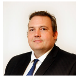
Jamie Halcro Johnston Scottish Conservative and Unionist Party