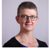
Maggie Chapman Scottish Green Party