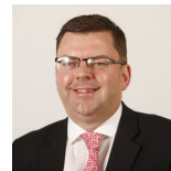
Colin Smyth Scottish Labour