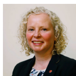
Convener Claire Baker Scottish Labour