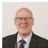
Kevin Stewart Scottish National Party