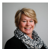
Deputy Convener Michelle Thomson Scottish National Party