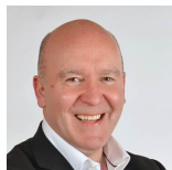
Willie Coffey Scottish National Party