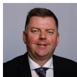
Colin Smyth Scottish Labour