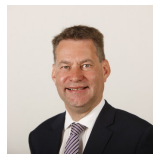
Murdo Fraser Scottish Conservative and Unionist Party