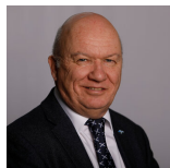
Gordon MacDonald Scottish National Party