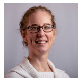
Lorna Slater Scottish Green Party