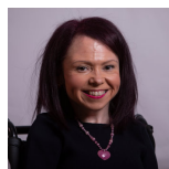
Pam Duncan-Glancy Scottish Labour