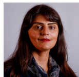
Pam Gosal Scottish Conservative and Unionist Party