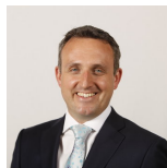
Deputy Convener Alex Cole-Hamilton Scottish Liberal Democrats