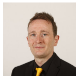
Fulton MacGregor Scottish National Party