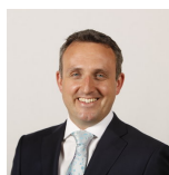
Deputy Convener Alex Cole-Hamilton Scottish Liberal Democrats