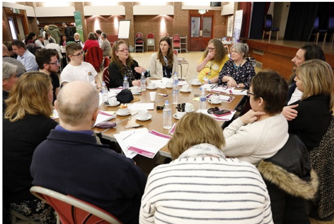
Source: The Scottish Parliament: Public Focus Group, Human Rights and the Scottish Parliament