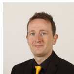
Fulton MacGregor Scottish National Party