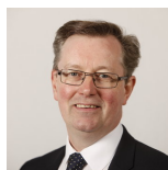
Alexander Stewart Scottish Conservative and Unionist Party