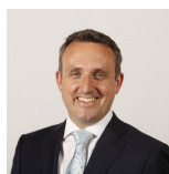
Deputy Convener Alex Cole-Hamilton Scottish Liberal Democrats