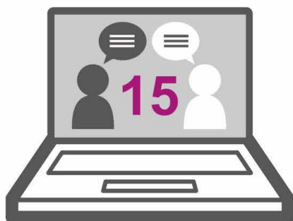
Virtual engagement activities