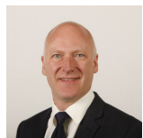
Joe FitzPatrick Scottish National Party