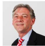
Richard Leonard Scottish Labour