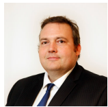
Jamie Halcro Johnston Scottish Conservative and Unionist Party