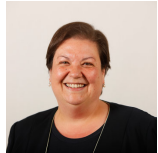
Jackie Baillie Scottish Labour