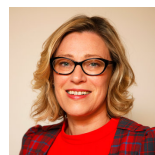
Gillian Martin Scottish National Party