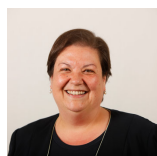
Jackie Baillie Scottish Labour