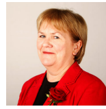
Deputy Convener Johann Lamont Scottish Labour