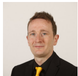
Fulton MacGregor Scottish National Party