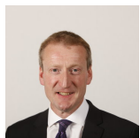
Tavish Scott Scottish Liberal Democrats