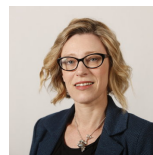
Gillian Martin Scottish National Party