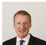
Tavish Scott Scottish Liberal Democrats