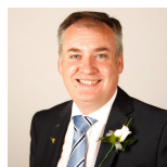
Richard Lochhead Scottish National Party