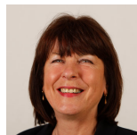
Mary Fee Scottish Labour