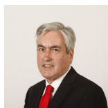
Iain Gray Scottish Labour