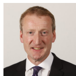
Tavish Scott Scottish Liberal Democrats