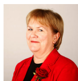
Deputy Convener Johann Lamont Scottish Labour