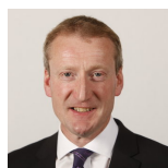
Tavish Scott Scottish Liberal Democrats