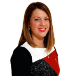
Jenny Gilruth Scottish National Party