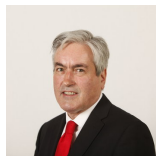
Iain Gray Scottish Labour