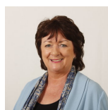
Rona Mackay Scottish National Party