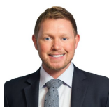
Jamie Greene Scottish Conservative and Unionist Party