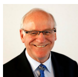
Gil Paterson Scottish National Party