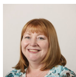
Convener Clare Adamson Scottish National Party